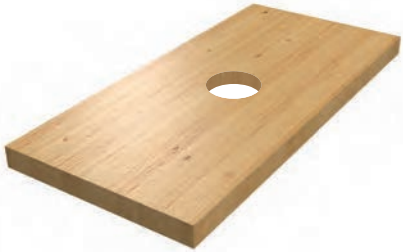
CUT HOLE IN TOP