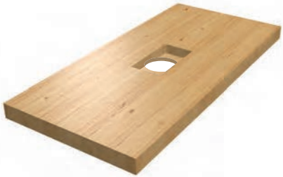
CUT HOLE IN BOTTOM

Rout/cut top of wood/stone/etc. for outlet bezel as indicated on template labeled "TOP TEMPLATE".