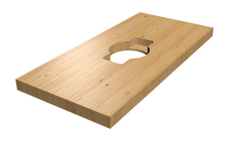
CUT HOLE IN TOP

Rout/cut bottom of wood/stone/etc. for outlet bezel as indicated on template labeled "BOTTOM TEMPLATE".