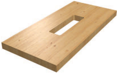
CUT HOLE IN WOOD

914-699-0101 sales@mormax.com mormax.com